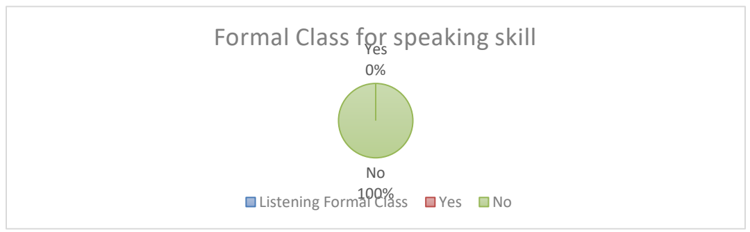
Figure 1, School Teaching Speaking Skills Formally Expressed by Students

There were 223 B.Ed. and M.Ed. students from the 2021 to 2023 academic sessions, were interviewed. The respondents were asked if they learning speaking and listening skills in a formal classroom. All of the respondents mentioned that they never had speaking and listening classes as skills of English learning.